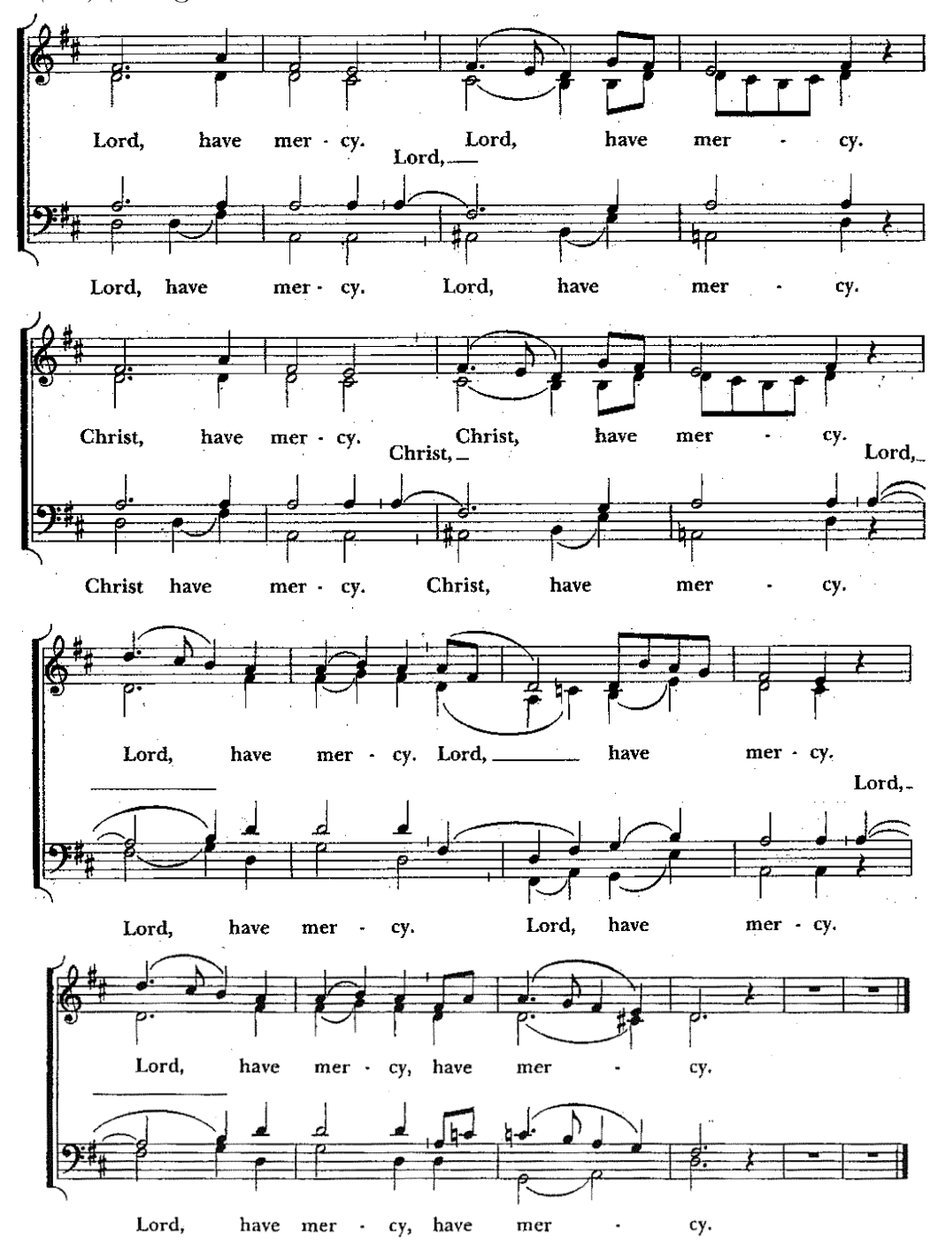
Kyrie (S96) (all sing)